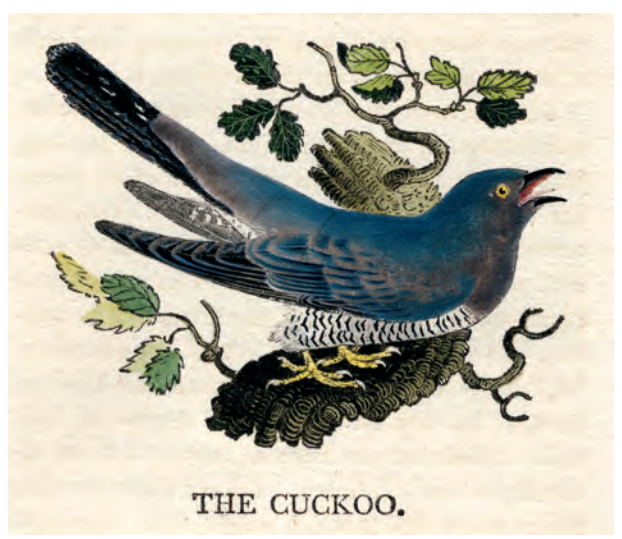
From Copy A. This colouring is similar to that of Copy B, though slightly darker.

The above offers compelling evidence for the existence of hand-coloured subscribers' editions of Bewick's Land Birds. In uncoloured state, Imperial Land Birds 1797 (1798) are uncommon. In 35 years this writer has owned four and known of perhaps twice as many others. Accepting the common thread in the colouring of copies A and B, but also bearing in mind the differences in presentation, binding styles with probable dates of commissioning, it is difficult to avoid a conclusion as follows. Because of the scarcity of 1797 ('98) Imperials, it seems inconceivable that some unknown Victorian lady would be in a position to while away her time colouring 'two copies' of this desirable large paper issue. Much more likely, because of the genuine rarity of the 'fully' hand coloured Land Birds of 1797 (1798), the law of probabilities suggests that the colouring was done before copies A and B departed their separate ways. That is, at a location in the city of Newcastle upon Tyne, probably very close to the printers, and soon after publication in 1798. But that informed speculation is as far as we can go with the evidence available.