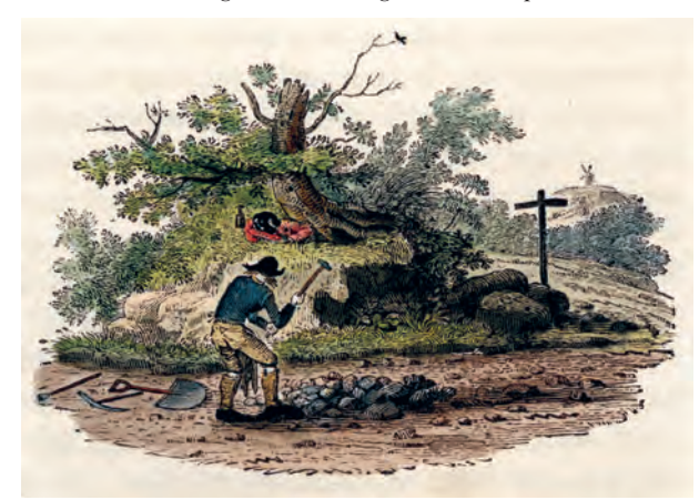
From Copy A: Vignette, p. 26: 'The Stonebreaker'. Colouring of clothes is different to that in Copy B.

The new information opens up some further lines of possible research, though of course the date itself is at odds with everything we can establish in respect of the two coloured copies at issue here. Should more 'completely' hand-coloured Land Birds turn up, the writer puts forward – with some confidence – the proposition that the genuine article will always have 'every' engraving finely hand coloured, with the white pigment often discoloured. It will be the Imperial octavo issue of 1797 (1798), with 'Price One Guinea in Boards' printed at the foot of the title page. And we would very much like to hear of it, even if our confident prediction be overturned! Please communicate with the editor of the Cherryburn Times if any more information emerges to throw light on these problems.