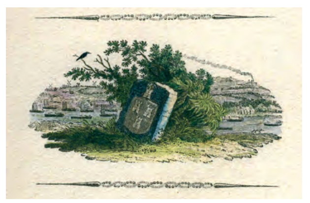
The title page vignette (only) from copy B. What seems to be a tombstone is in fact a bounday stone, showing the three castles of Newcastle's coat of arms.

However, a significant aspect of the demand was clearly for coloured images, and although there had been some technically successful experiments in colour printing during the eighteenth century (and even earlier), they were hopelessly complicated and expensive, so only a few seriously rich buyers could afford them. It remained an exclusive, experimental area of production. But the taste for coloured pictures was clearly there, and the obvious way to meet it was to supply hand-coloured versions of black-printed pictures. The period from about 1780 until about 1820 was the heyday for hand colouring. Buyers were usually asked to pay twice the price for a handcoloured copy of an uncoloured print, often having to wait for the copy to be made. Such practice would seem to indicate that demand was running ahead of supply. In any case it was usually the retailer who organised the colouring.